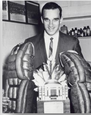
R O G E R C R O Z I E R DETROIT RED WINGS 1966 CONN SMYTHE TROPHY WINNER 6 wins, one shutout, 2.34 GAA, .914 sv pct in 12 games